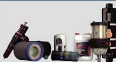
500 hours genset spare parts