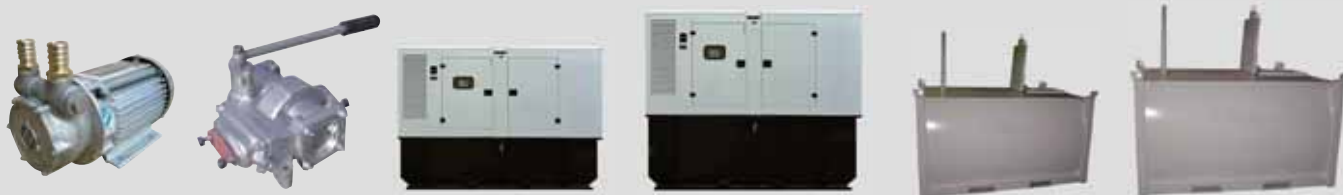
Auto filling fuel pump